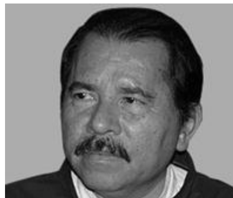
Nicaraguan President Daniel Ortega, a "former" communist, has joined a lawsuit against the government of South Carolina over its anti-illegal alien law.