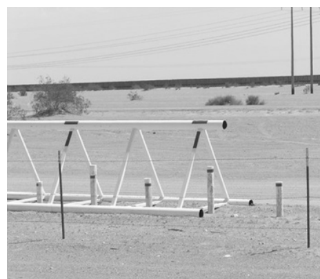
The wide-open southern border. Petitions from Council supporters demanding that it be closed and no amnesty be extended to illegals pouring in.