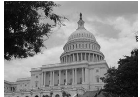
The U.S. Border Security Council has outlined an ambitious 2011 legislative agenda.