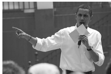
President Barack Obama has effectively granted amnesty to millions of illegal immigrants. His edict is unconstitutional and will destroy America.