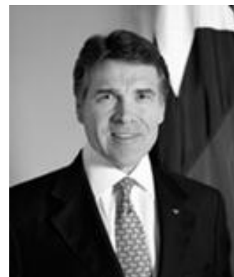
Rick Perry's position on border security does not impress the U.S. Border Security Council