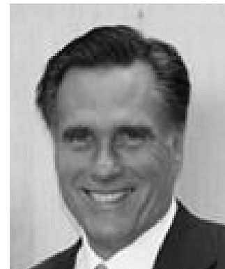
If elected President, the U.S. Border Security Council worries that Mitt Romney will "do a George W. Bush" and work overtime to pass amnesty.