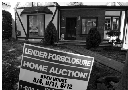
Foreclosures on 5 million homes purchased fraudulently by illegal aliens could help collapse the American financial system.

gotten everything it wanted and now ordinary Americans are going to pay the price," says U.S. Border