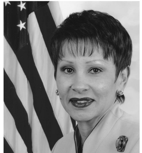
Congressional Hispanic Caucus Chairwoman Nydia Velazquez wants an Amnesty bill this year.