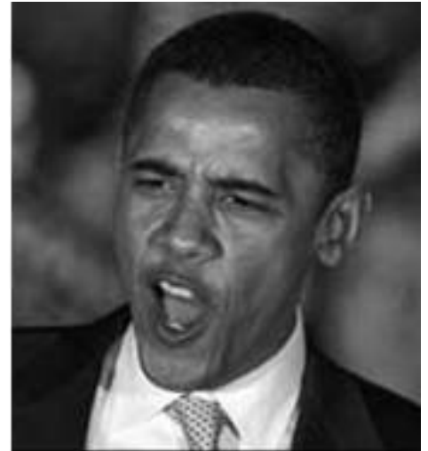
President Obama was not able to keep his pledge to pass an amnesty bill in 2009. However, he will try even harder to appease the illegal immigrant lobby in 2010.

The ability to quickly respond and then keep up a sustained amount of public opposition to pro-illegal alien legislation is what the U.S. Border Security Council has become known for. In the case of S.9, the Council was the first national advocacy group to point out how Senator Reid's bill went far beyond merely granting amnesty to illegal aliens. The bill would make it easier for individuals accused of terrorism to enter the country and would defund the border fence. The Council renamed